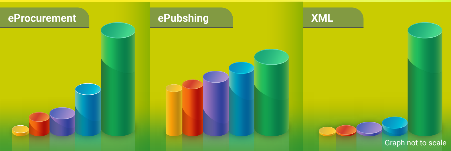
Graph not to scale